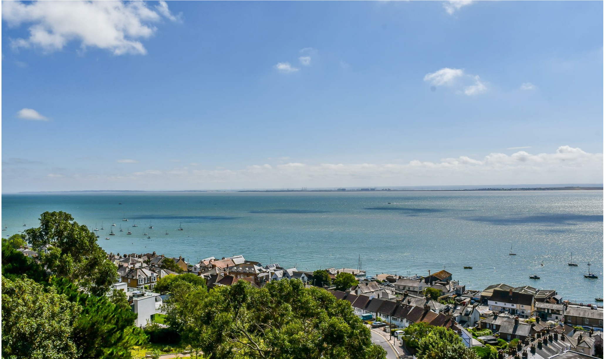
Broadway West, Leigh-On-Sea £850,000